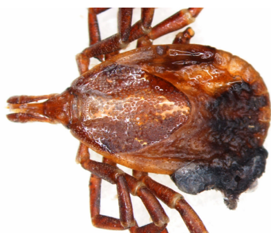
FIGURE 1. Dorsal view of adult A. longirostre female found in Oklahoma, note the elongated scutum.

On 24 September 2005, a homeowner discovered a large, odd looking tick crawling on a propane tank in Pittsburg County, south of Hartshorne, Oklahoma. The tick was collected, brought to the Pittsburg County Oklahoma Cooperative Extension Service office where it was sent by mail to the Plant Disease and Insect Diagnostic Lab (PDIDL) in the Department of Entomology and Plant Pathology at Oklahoma State University. The tick was identified on 3 October 2005 using an established key (Jones et al. 1972) (Figs 1, 2) as an adult female A. longirostre and given an ascension number (#200501316). It was later verified using detailed descriptions by Voltzit (2007).